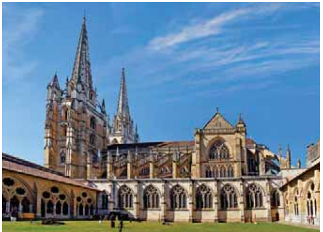
Right: Sainte-Marie Cathedral