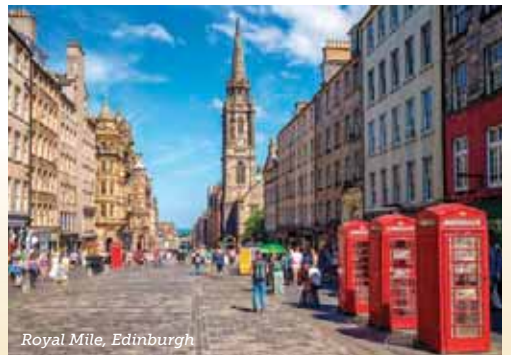
Royal Mile, Edinburgh

Free Time: Make plans for dinner on your own before the Tattoo performance.