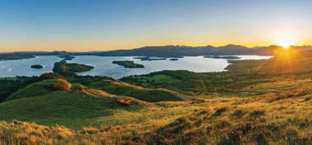
Loch Lomond, The Trossachs National Park

St Andrews. On your way to St Andrews, see the National Wallace Monument. Then, tour