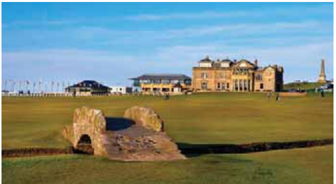
The Old Course at St Andrews