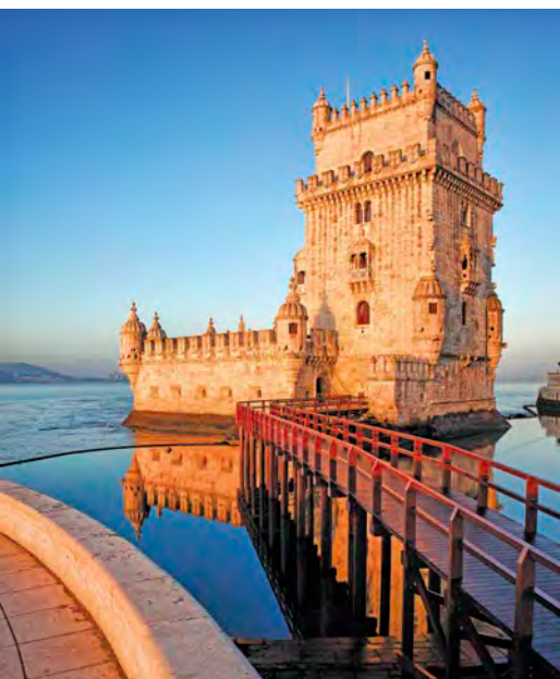
Tower of Belém, Lisbon