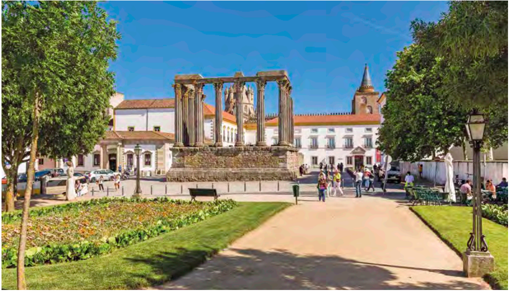
Temple of Diana, Évora