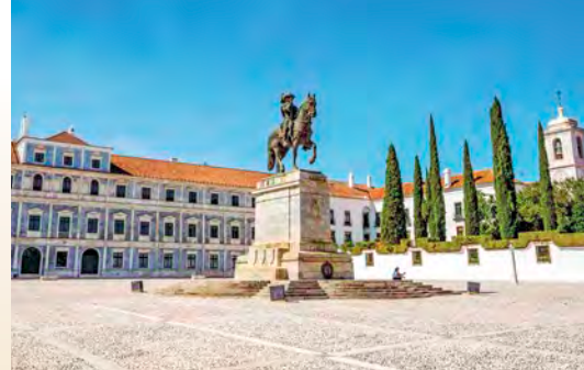
Ducal Palace, Vila Viçosa

Monsaraz. Take in the medieval atmosphere of this picturesque, hilltop village and sweeping countryside views during a guided stroll. Next, travel to Herdade do Esporão, a family-owned business on a large estate. Learn how their olive oil is made on a tour, take part in a unique