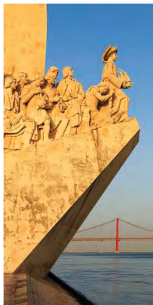
Monument to the Discoveries, Lisbon

Knowledgeable Lecturers deepen your appreciation for the region and its history, culture and current events.