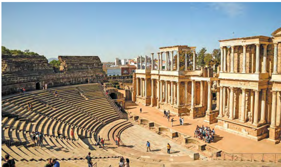
Amphitheater, Mérida, Spain