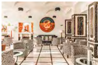
Alentejo Marmoris Hotel & Spa | Vila Viçosa