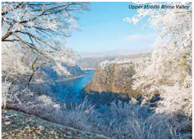
Upper Middle Rhine Valley