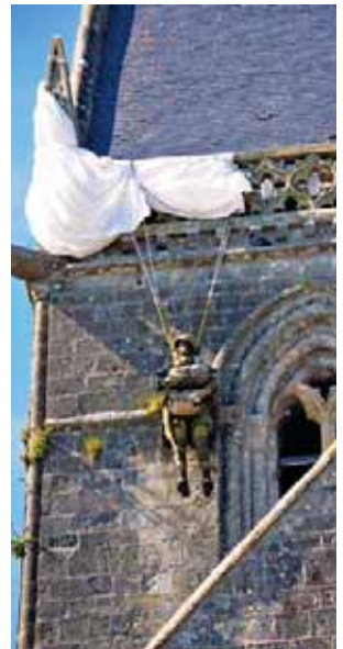
Private John Steele Monument, Sainte-Mère-Église

Knowledgeable Lecturers deepen your appreciation for the region and its history, culture and current events.