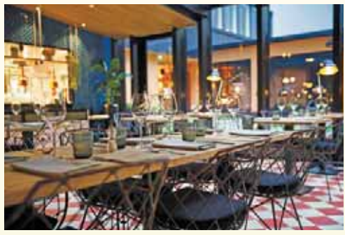
Hotel U14 | Helsinki