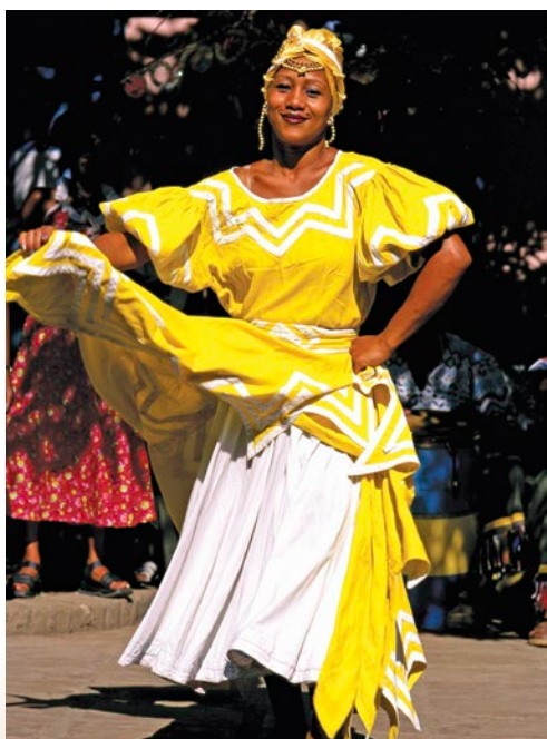
Top: Vintage automobiles, Havana Cover: Cuban jazz musician Mail panel: Old Havana | Afro-Cuban musician