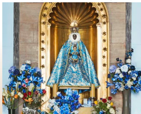
Black Madonna, Iglesia de Nuestra Señora de Regla

After lunch in Matanzas, visit the Sugar Mill Triunvirato to see the moving, 19th-century Monument to the Slaves' Rebellion.