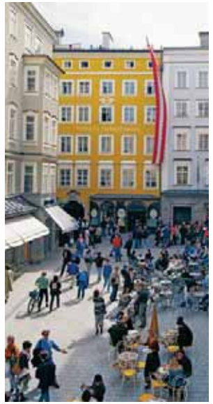
Mozart's Birthplace, Salzburg