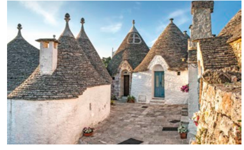
Top: Polignano a Mare | Above: Trullo