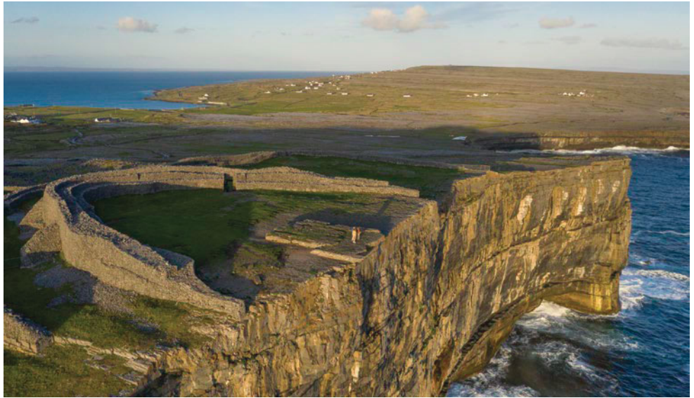
Dun Aengus, Inishmore