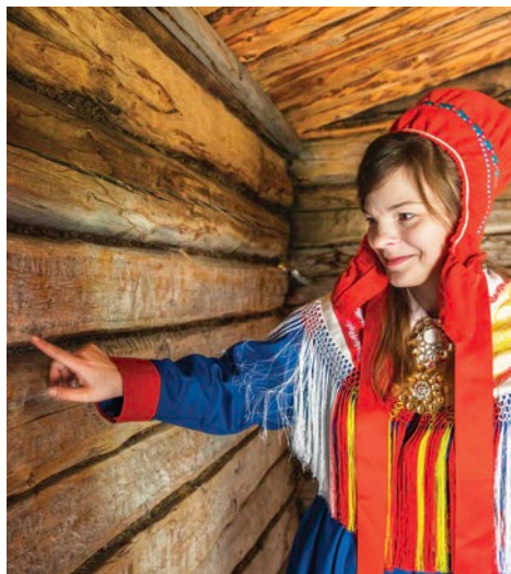
Sámi woman, Sámi Museum Siida

Savor a refreshing break by a fire, complemented by a toasty beverage and tales about the Northern Lights.