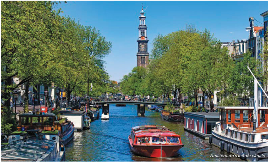
Amsterdam's iconic canals