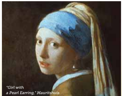
"Girl with a Pearl Earring," Mauritshuis