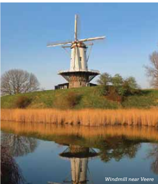
Windmill near Veere