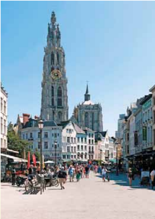
Cathedral of Our Lady, Antwerp