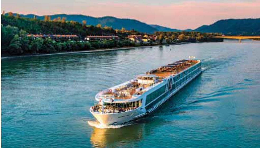
MS Amadeus Cara