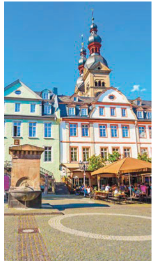
Market Square, Koblenz

Knowledgeable Lecturers deepen your appreciation for the region and its history, culture and current events.