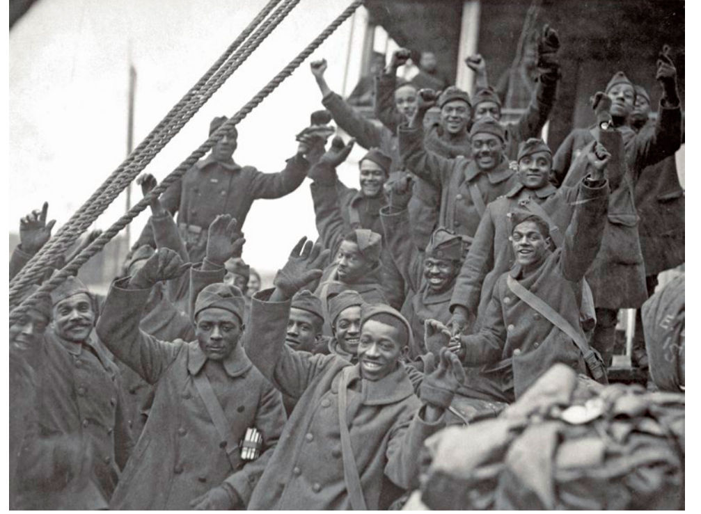
369th Infantry Regiment

Latin Quarter and Saint-Germain-des-Prés, where French jazz evolved and African American musicians played post-WWII. Learn about musical legends, followed by dinner and a concert at a local jazz club.