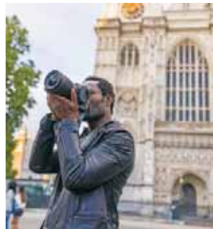
Photo op on walking tour

Knowledgeable Lecturers deepen your appreciation for the region and its history, culture and current events.