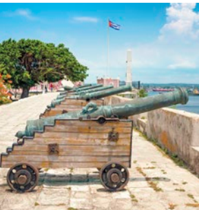
Cannons at fortification, Havana