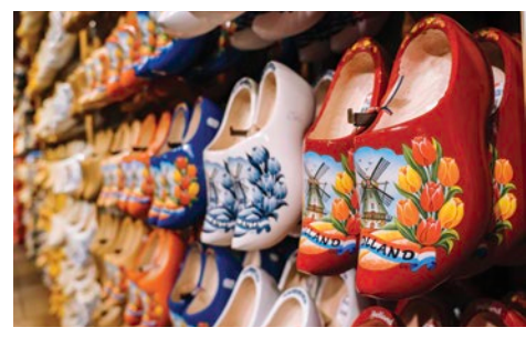
Top: Amsterdam | Above: Traditional wooden shoes