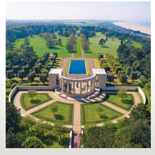
Normandy American Cemetery

D-Day and the Battle of Normandy. Begin in Arromanches, where you'll see the site of an offshore mulberry harbor and visit the museum there. These floating harbors enabled the Allies to funnel enormous resources into France to wage war against Hitler. Afterward, walk along Omaha Beach, see the memorial and reflect upon the exceptional courage of the Allied landing forces, who valiantly advanced under devastating fire across the heavily fortified