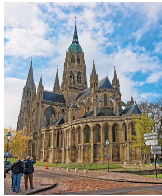
Notre Dame Cathedral, Baveux