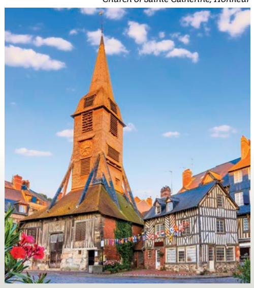
Church of Sainte Catherine, Honfleur

Free Time: Select a special place for dinner. Your Travel Director can assist with planning.