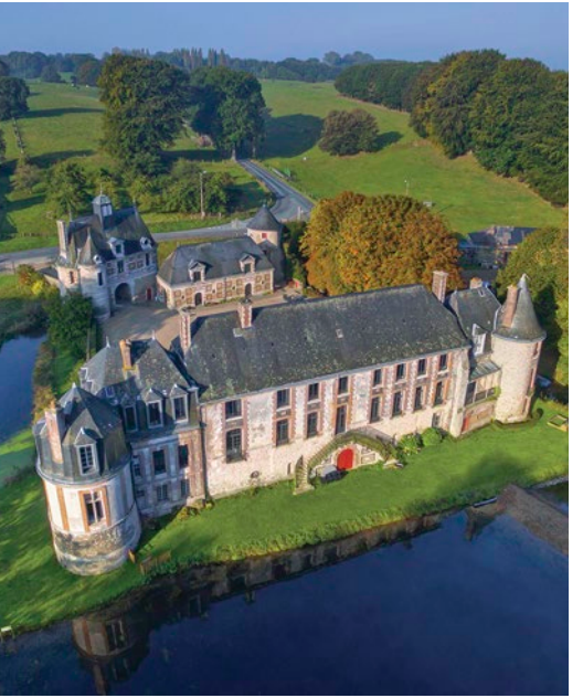
Château du Bec