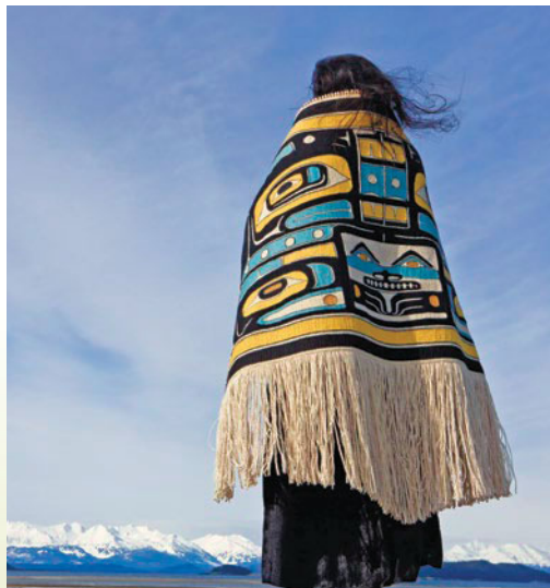
Native Alaskan wearing a chilkat blanket