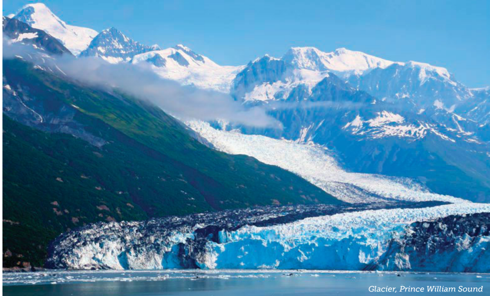
Glacier, Prince William Sound

Sit down to a delicious dinner at your hotel. Dig into flavorful cuisine, complemented by friendly service and excellent views.