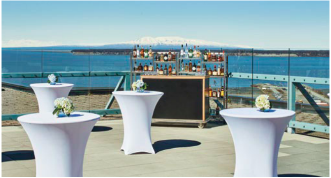
Hilton Anchorage | Anchorage