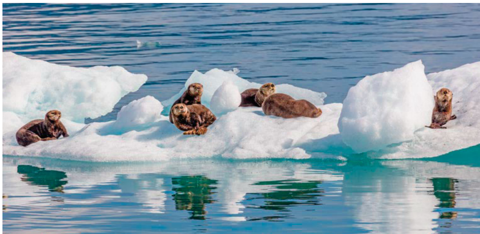
Sea otters, Prince William Sound