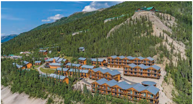
Denali Bluffs Hotel | Denali