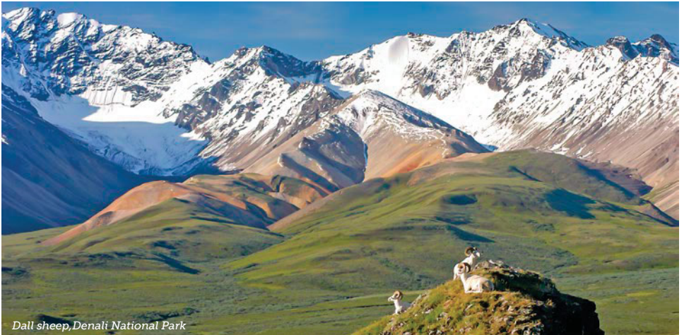
Dall sheep, Denali National Park