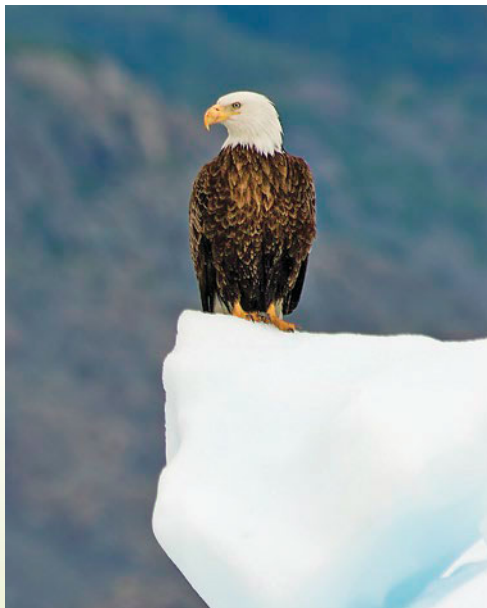
Bald eagle, Prince William Sound

Dinner is at your leisure tonight. Experience the city's food scene by dining on fresh oysters, cod, halibut and more.