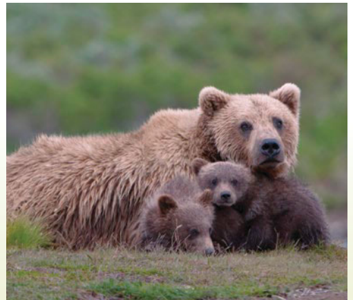
Grizzly bear and cubs

Enrichment: Geography & History of Denali National Park. Join a resident mountain climber and naturalist who will enlighten you with the history and unique geography of this storied, magical region.