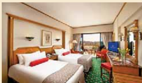
Sonesta St. George Hotel Luxor | Luxor (Rooms renovated in 2025 | Updated images coming soon)