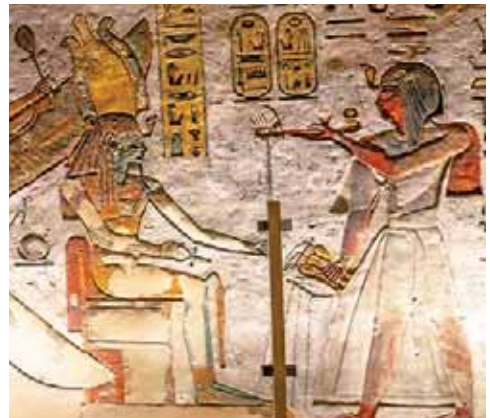
Right: Ancient hieroglyphics, Valley of the Kings