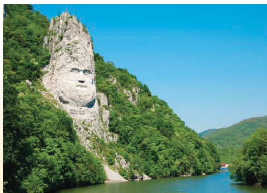
Decebalus stone sculpture, Iron Gate Gorge

Picturesque Passau. See Niedernburg Abbey, the medieval Veste Oberhaus, St. Stephen's Cathedral and other celebrated sites.