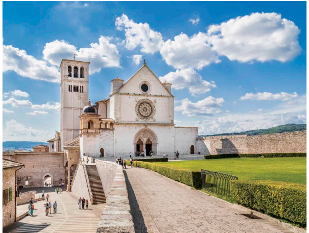
Basilica of San Francesco d'Assisi