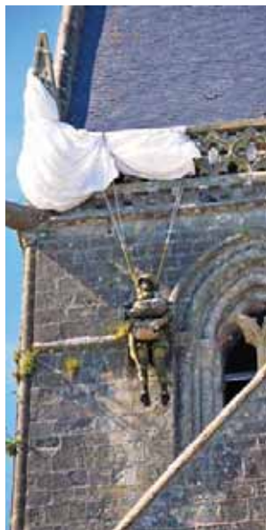
Private John Steele Monument, Sainte-Mère-Église

Knowledgeable Lecturers deepen your appreciation for the region and its history, culture and current events.