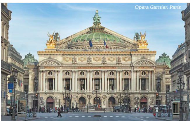
Opera Garnier, Paris