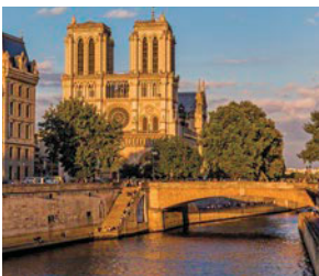
Notre Dame, Paris