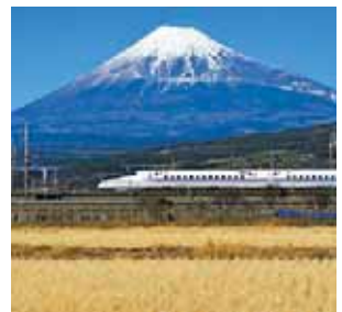
Catch a glimpse of Mt. Fuji aboard the Shinkansen, a high-speed bullet train