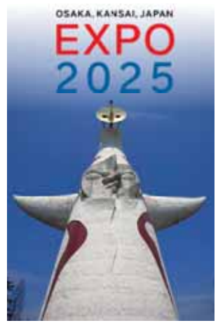
World Expo Commemorative Park