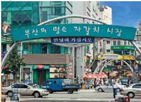
Gukje Market, Busan

World Expo. Spend the day and evening exploring groundbreaking architecture, art installations and hundreds of exhibits. Relish immersive cultural experiences and sample global cuisines from more than 50 countries.