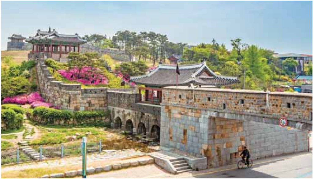
Hwaseong Fortress, Seoul