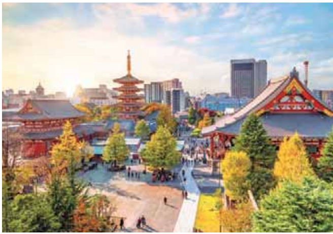
Sensō-ji Temple, Tokyo