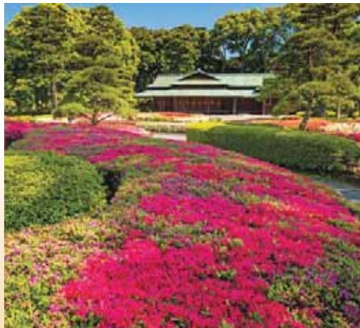
Japanese gardens at the Imperial Palace, Toyko