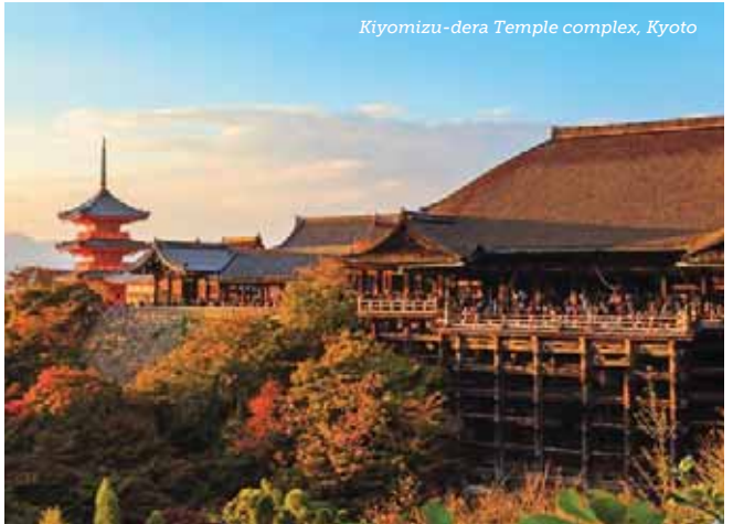
Kiyomizu-dera Temple complex, Kyoto