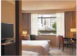
The Westin Josun Seoul | South Korea