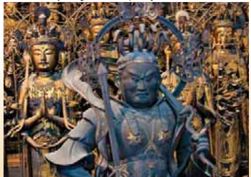
Statues at Sanjūsangen-dō Temple, Kyoto

Tokyo Highlights. This morning, embark on a sightseeing tour of Tokyo. Begin with a visit to Tokyo's oldest temple, Sensō-ji. Admire the massive red lantern at the entrance gate and the five-story Goju-no-to pagoda. Then, at the Tokyo National Museum, view the collection of