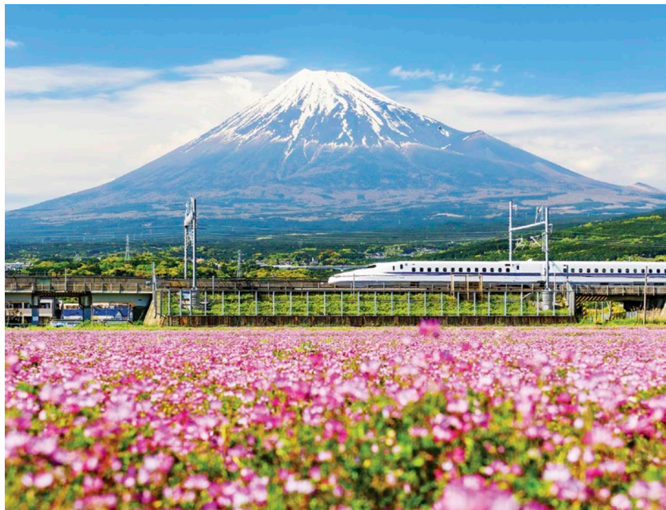
Shinkansen passing Mt. Fuji

Tokyo. Drive through the chic, stylish Ginza shopping district. Witness Tokyo Skytree, the world's tallest building. Visit the colorful, Buddhist Asakusa Kannon Temple. Explore the Imperial Palace's exquisite gardens.