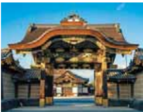
Nijō Castle, Kyoto