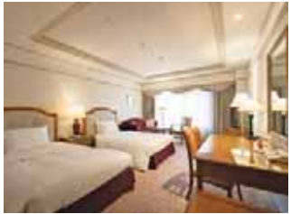
Hotel Nikko Princess Kyoto | Japan