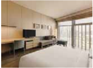
Park Hyatt Busan | South Korea