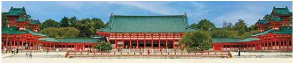
Heian-jingū Shrine, Kyoto