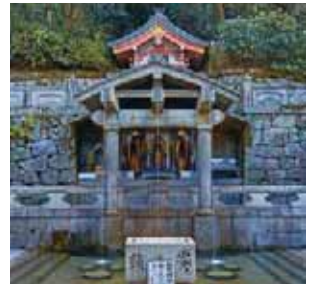
Otowa Waterfall, Kyoto