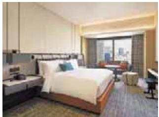
Mesm Tokyo, Autograph Collection | Japan