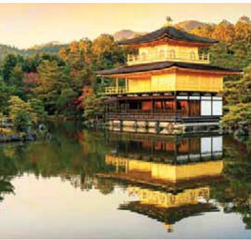
Left: The golden Kinkaku-ji Temple, Kyoto Below: Take in spectacular views of Tokyo from the observation deck of the Skytree.