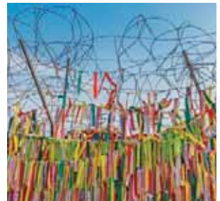
Prayer ribbons, DMZ

Knowledgeable Lecturers deepen your appreciation for the region and its history, culture and current events.