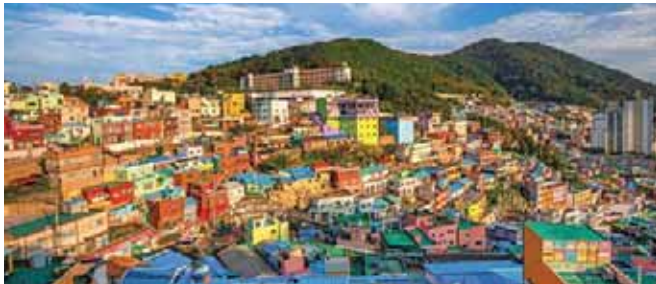
Colorful Gamcheon Culture Village, Busan