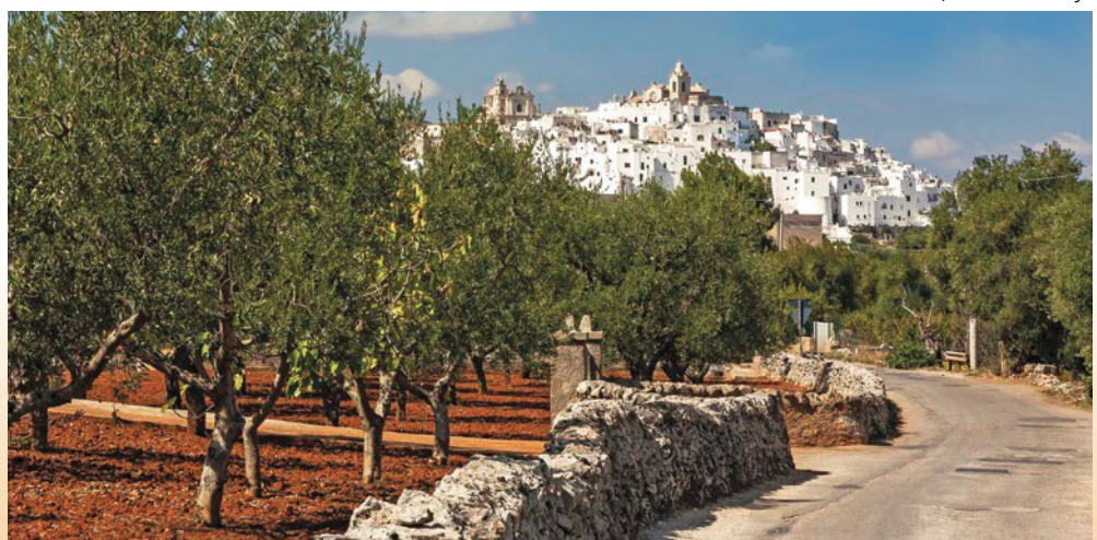
Ostuni, "The White City"

Visit a family-run olive mill in the sun-baked countryside. Learn about the history and cultivation process of olives. Unwind over lunch and gather with the mill's employees or owners to discuss life in Italy.