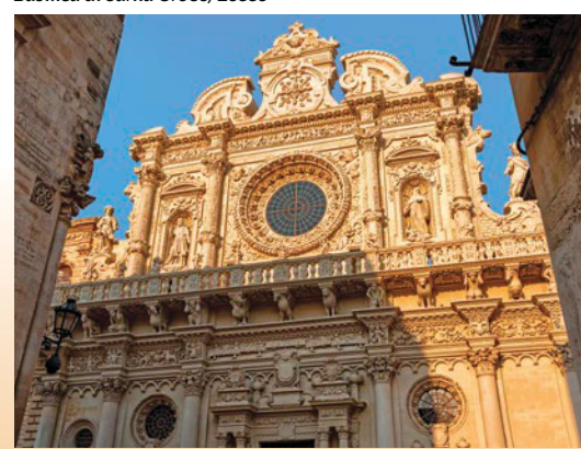
Basilica di Santa Croce, Lecce

Enrichment: History & Architecture of Lecce & Ostuni. Learn about this region's fascinating history and unique architectural styles.