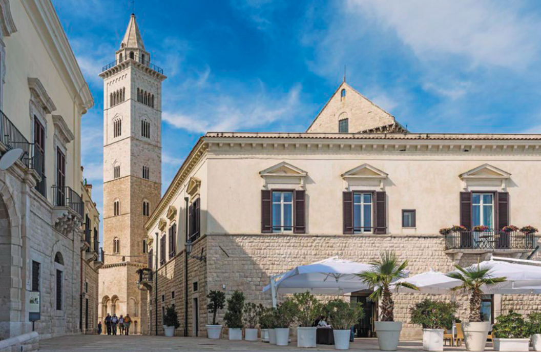
Cathedral bell tower, Trani