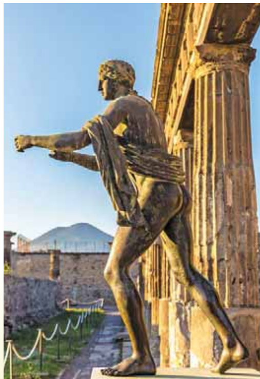
Temple of Apollo, Pompeii