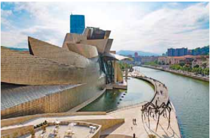
Guggenheim Museum, Bilbao