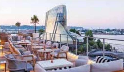
Renaissance Bordeaux Hotel | Bordeaux