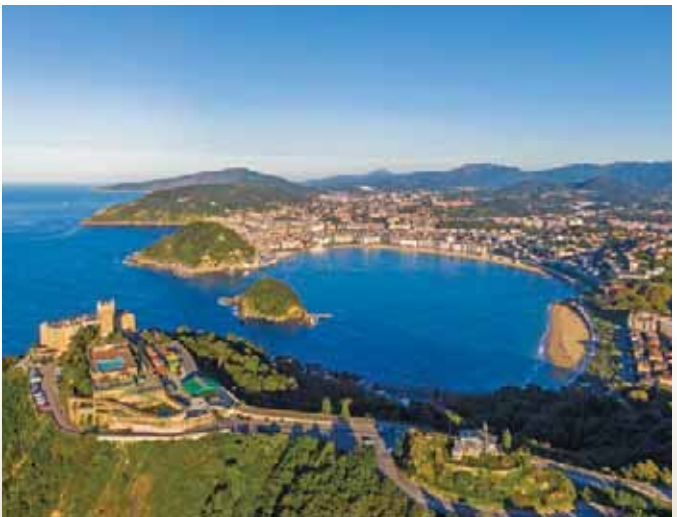
La Concha Bay, San Sebastián