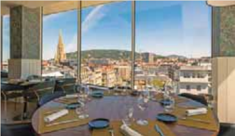
Catalonia Donosti Hotel | San Sebastián