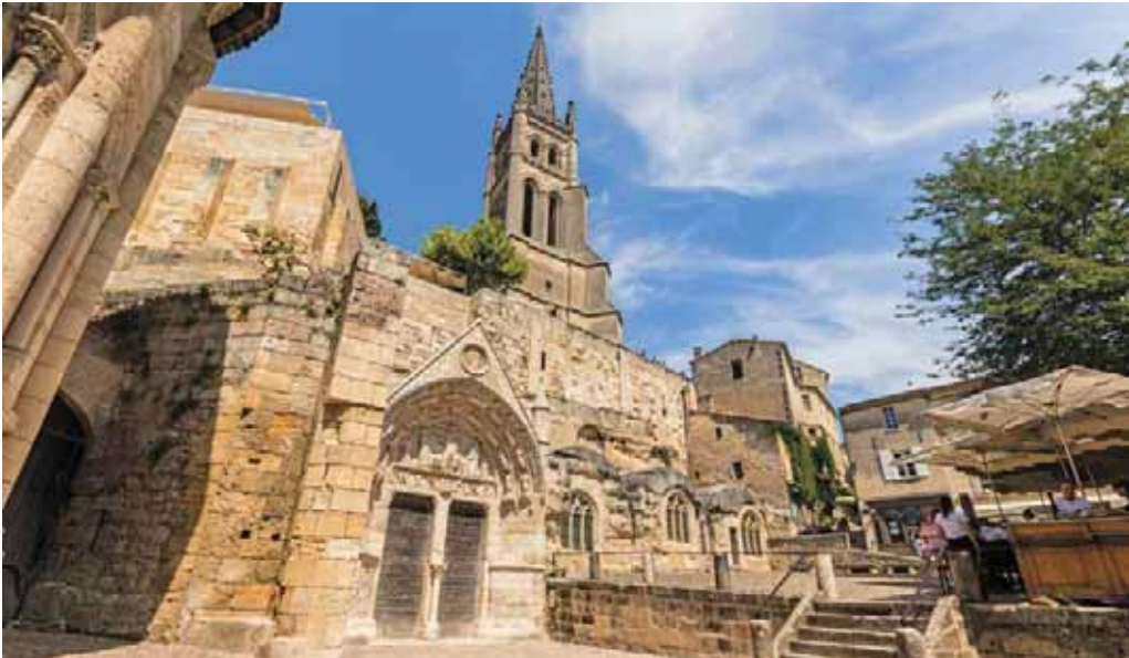
Monolithic Church, Saint-Émilion