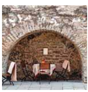
Old Town, Tallinn