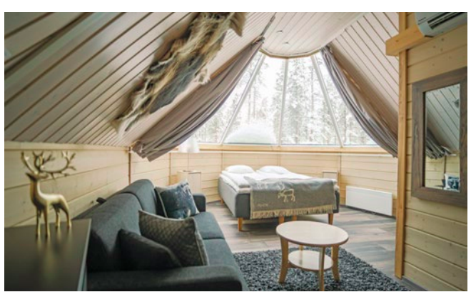
Northern Lights Village | Saariselkä