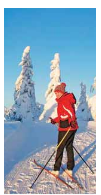
Exploring at Northern Lights Village