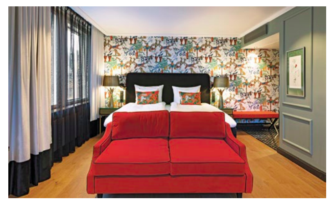
Hotel U14 | Helsinki