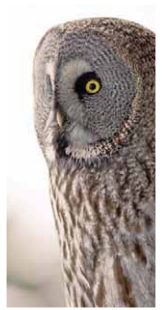
Great Grey Owl, Lapland