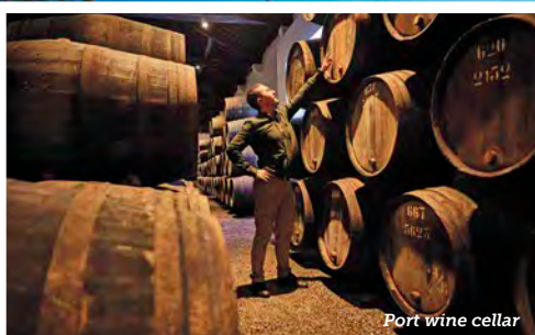
Port wine cellar

Continue to a port wine cellar for a wine tasting. (Active)