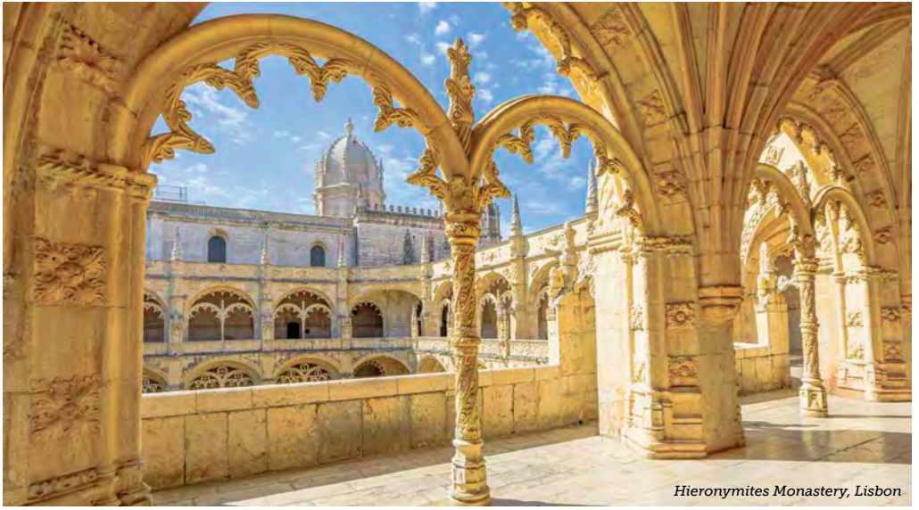
Hieronymites Monastery, Lisbon