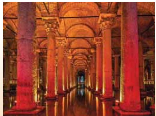
Basilica Cistern, Istanbul

Ozkonak Underground City. Take a guided tour of a subterranean network of chambers that sheltered thousands from enemy raids.