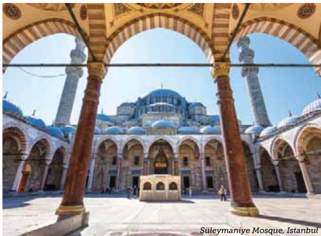
Süleymaniye Mosque, Istanbul