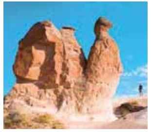
Devrent Valley, Cappadocia