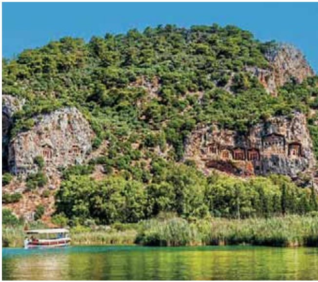
Lycian Tombs of Kaunos