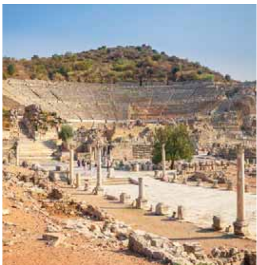
Left: Library of Celsus, Ephesus | Above: Grand Theater, Ephesus

Avanos Pottery Workshop. Watch skilled potters shape pieces out of the local red clay and learn about their techniques and designs.