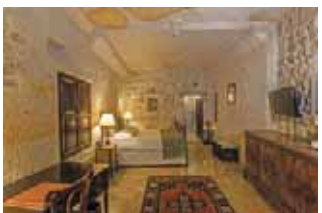
Yunak Evleri Cave Hotel | Ürgüp (Cappadocia)