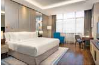
Barceló Istanbul Hotel | Istanbul