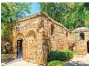
House of the Virgin Mary, Ephesus