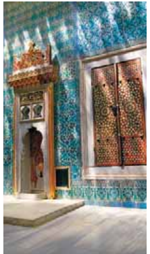
Topkapi Palace, Istanbul

Knowledgeable Lecturers deepen your appreciation for the region and its history, culture and current events.