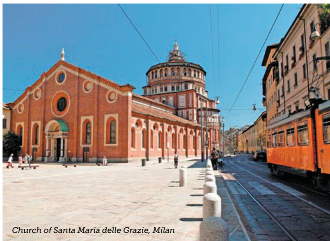
Church of Santa Maria delle Grazie, Milan