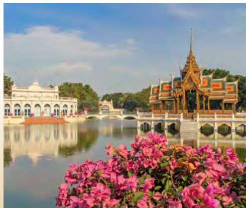
Bang Pa-In Palace

🌐 AHI Connects | Local Life. Uncover culinary traditions with a Cambodian family