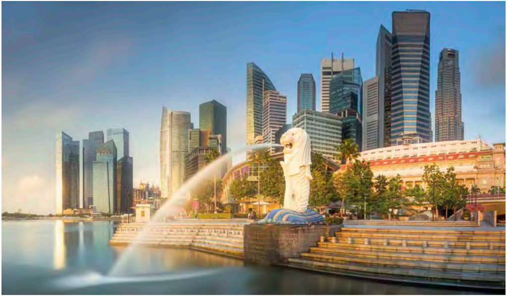
Merlion Park, Singapore