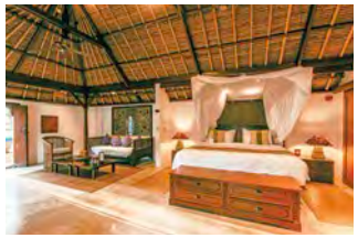
Belmond Jimbaran Puri Resort | Bali, Indonesia