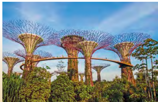
Gardens by the Bay, Singapore

Gardens by the Bay. Discover Singapore's landmark oasis of floral features and garden artistry. See the iconic Supertrees, made up of over 150,000 plants, plus bromeliads, orchids, ferns and climbers. Chart your own course through the Flower Dome, the world's largest