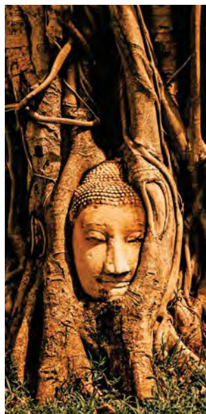
Buddha head, Ayutthaya

Knowledgeable Lecturers deepen your appreciation for the region and its history, culture and current events.