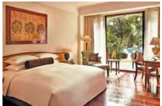
Sofitel Angkor Phokeethra Golf and Spa Resort | Siem Reap, Cambodia