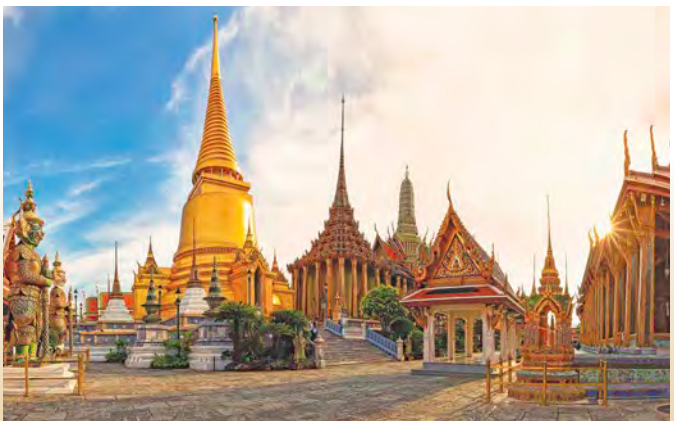
Grand Palace complex, Bangkok