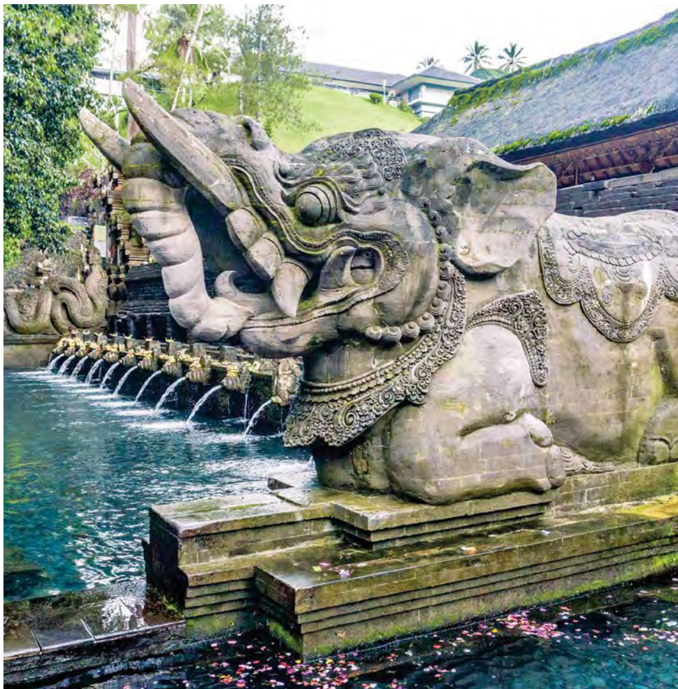
Tirta Empul, a holy water temple near Tampak Siring, Bali