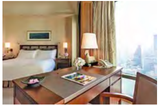
The Peninsula Bangkok | Bangkok, Thailand