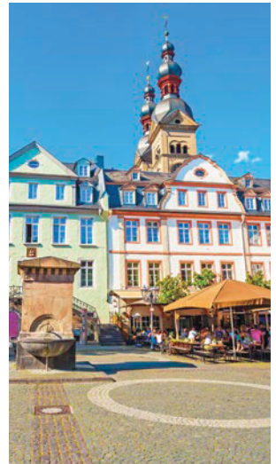
Market Square, Koblenz

Knowledgeable Lecturers deepen your appreciation for the region and its history, culture and current events.