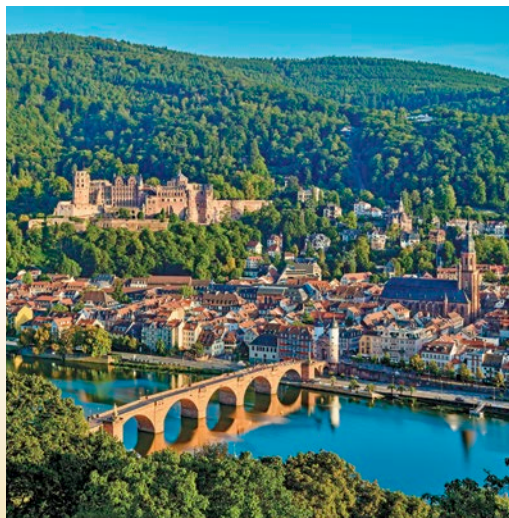
View of Heidelberg from Philosopher's Way