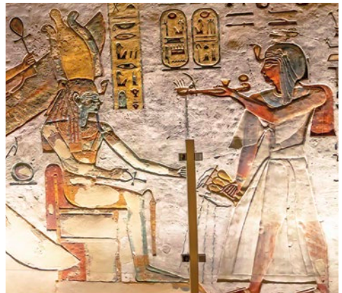
Right: Ancient hieroglyphics, Valley of the Kings