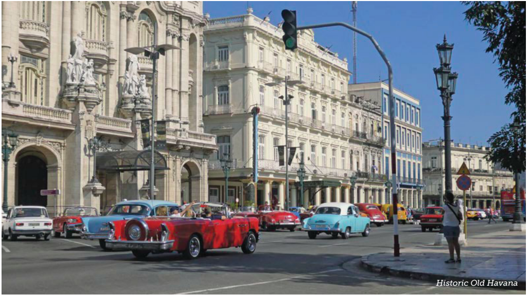
Historic Old Havana