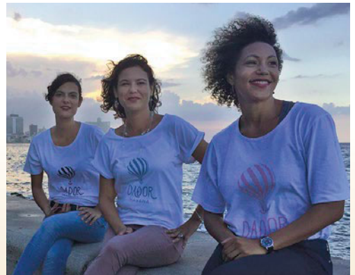
Founders and owners of Dador

Jewish Culture & Cuban Dance. Visit the Ashkenazi Community Center to learn about Cuba's Jewish culture. Then, stop at Malpaso, a contemporary dance studio to meet and