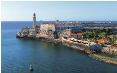
La Cabaña fortress, Havana harbor

Note: A small portion of the cost of your trip supports the Johns Hopkins Alumni Travel Program.