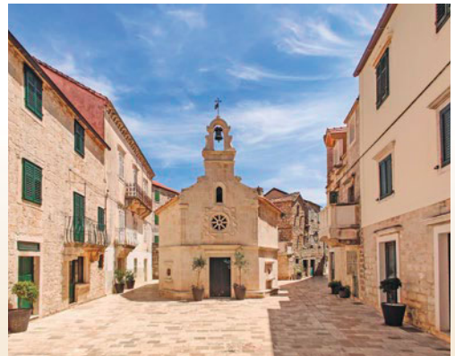
Stari Grad, Hvar

Šibenik. Šibenik is a proud city that welcomes visitors with lovely alleys, squares and striking