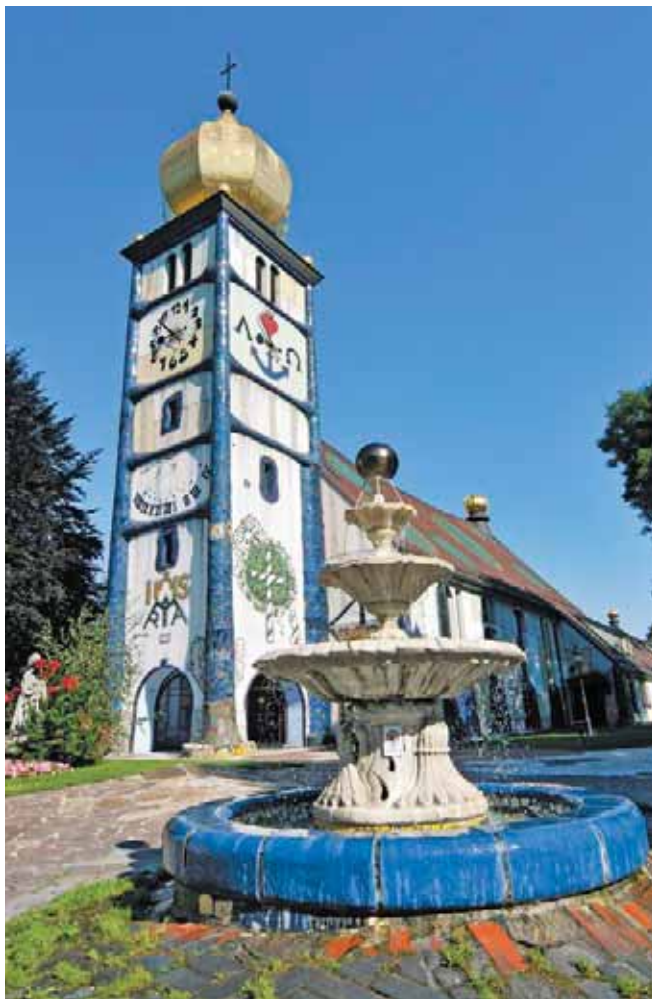
St. Barbara Church, Bärnbach