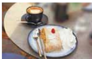
Apple strudel, Graz