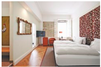
Hotel Weitzer | Graz