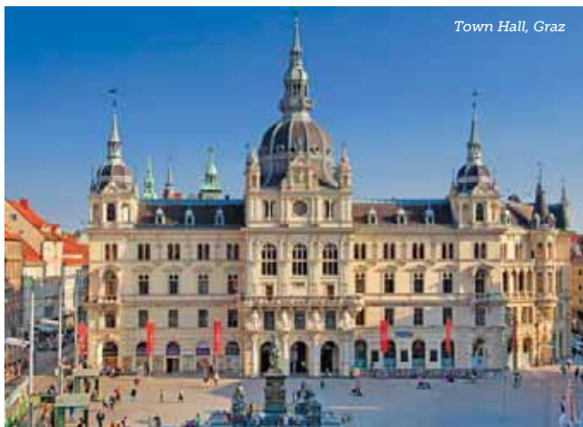
Town Hall, Graz