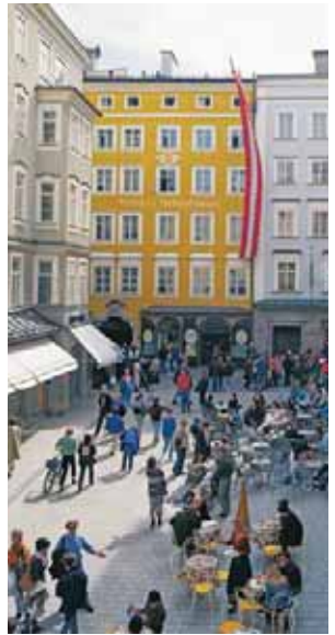
Mozart's Birthplace, Salzburg