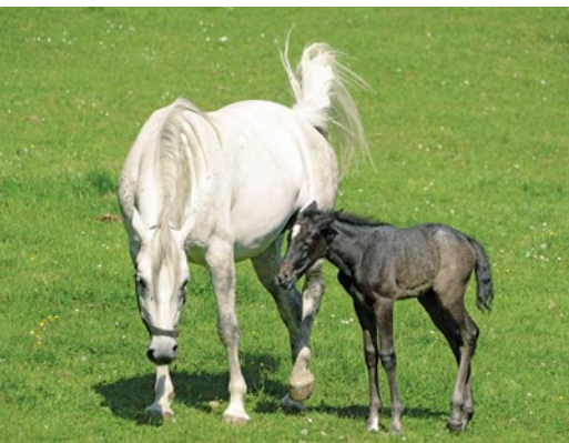
Lippizaner mother & foal

Free Time: Explore the area a bit and choose among the wide selection restaurants in Salzburg, from refined contemporary or classical Austrian cuisines to casual fare at a café or beer garden.