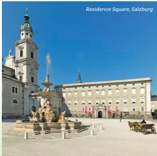
Residence Square, Salzburg