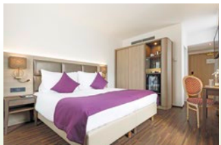
Imlauer Hotel Pitter Salzburg | Salzburg