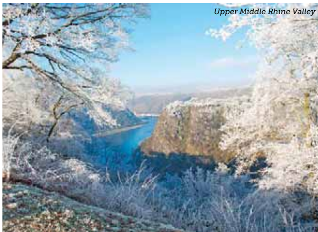
Upper Middle Rhine Valley