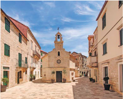
Stari Grad, Hvar

Šibenik. Šibenik is a proud city that welcomes visitors with lovely alleys, squares and striking