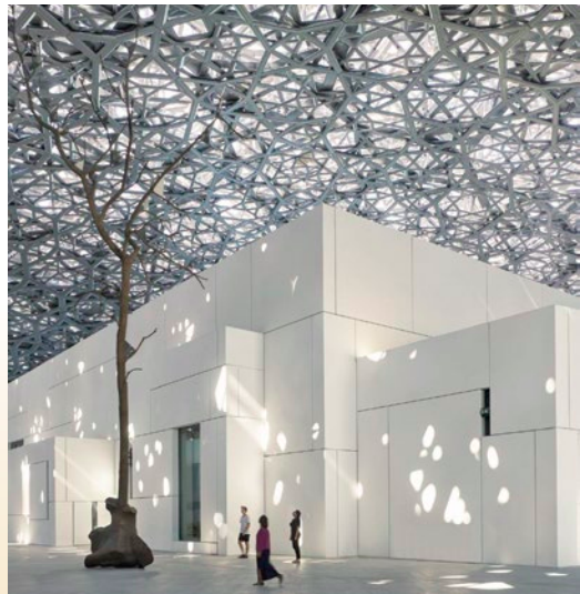
Louvre Abu Dhabi

Explore Abu Dhabi's roots at Heritage Village, which brings to life Bedouin traditions within