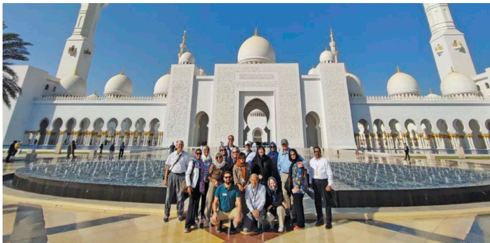
Sheikh Zayed Grand Mosque, Abu Dhabi

Please note that some excursions on this trip require passengers to be able to maintain a moderate walking pace, including over uneven surfaces and up and down steps. A minimum number of passengers is required to confirm faculty or host participation.