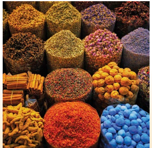
Spice Souk, Old Dubai

🌐 Elective | Dubai Desert Conservation Reserve. Head into the Arabian Desert for a guided drive within this protected desert