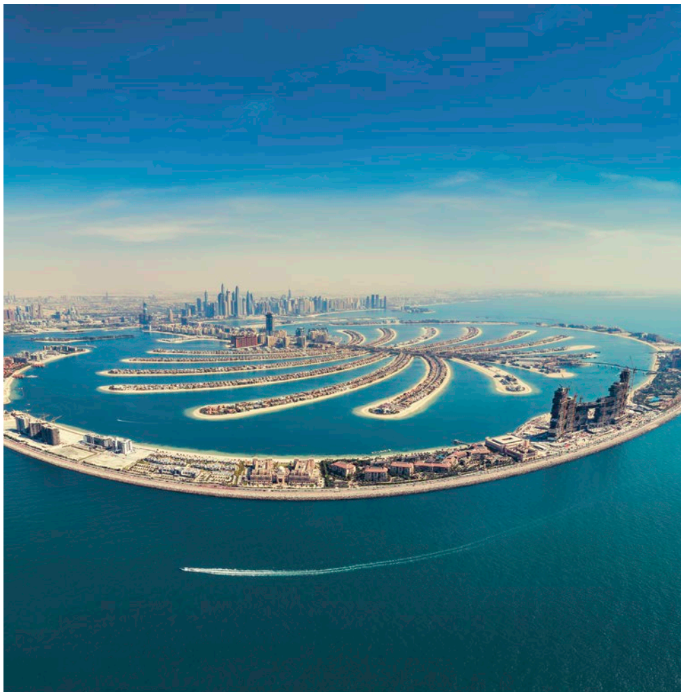
Palm Jumeirah, Dubai