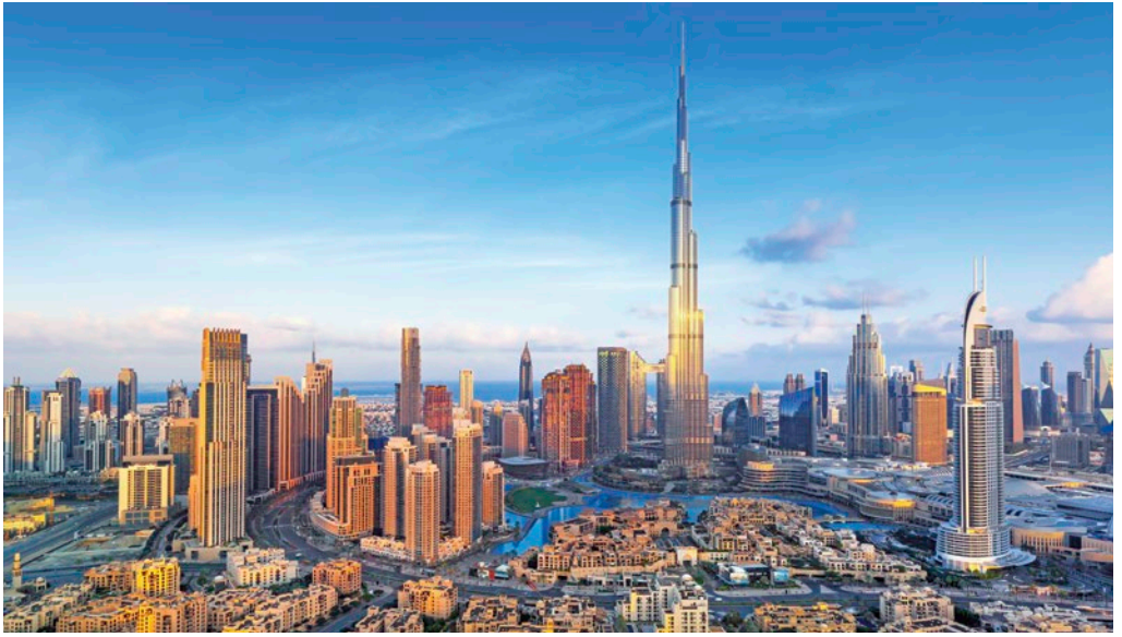
Burj Khalifa, Dubai skyline