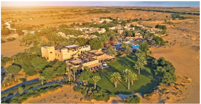
Bab Al Shams Desert Resort & Spa | Arabian Desert