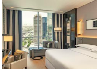
Sheraton Grand Hotel, Dubai | Dubai