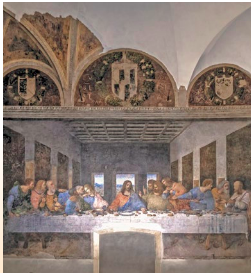
Leonardo da Vinci's "The Last Supper"