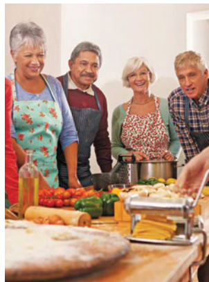
Piedmontese cooking class