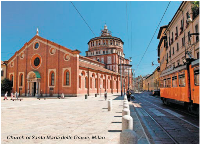
Church of Santa Maria delle Grazie, Milan