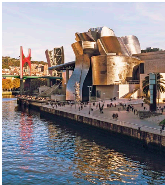
Guggenheim Bilbao Museum

Come along on an immersive exploration of Basque Country, a fascinating and beautiful region that stretches across northern Spain and southwest France along the Bay of Biscay. One of Europe's oldest people, the Basques maintained their individuality and language over thousands of years due to the mountainous terrain which surrounded and isolated them. You'll encounter an ancient, proud culture with a dual identity in a region brimming with heartfelt traditions, vibrant communities and captivating beauty. Embrace today's exuberant, thriving Basque homeland on this exceptional journey!