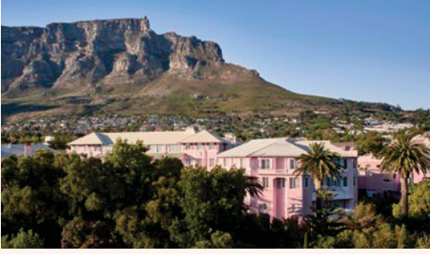
Mount Nelson, A Belmond Hotel | Cape Town