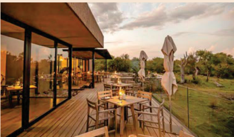
Kapama River Lodge | Kapama Private Game Reserve