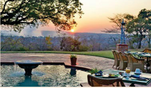
The Victoria Falls Hotel | Victoria Falls