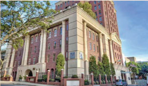
54 on Bath | Johannesburg