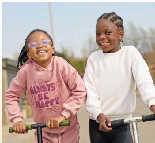
Youth program in Soweto