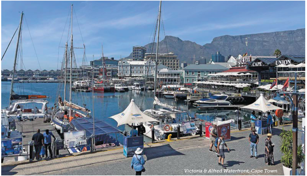
Victoria & Alfred Waterfront, Cape Town