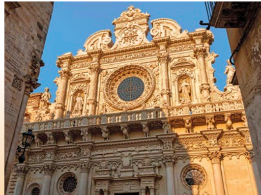
Basilica di Santa Croce, Lecce

Enrichment: History & Architecture of Lecce & Ostuni. Learn about this region's fascinating history and unique architectural styles.