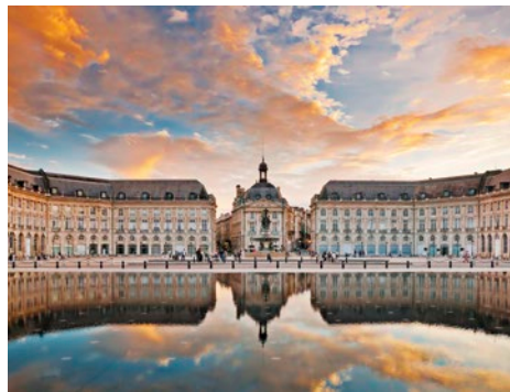
Miroir d'Eau, Place de la Bourse

Laguardia. Soak up the wonderful ambience of the capital of Spain's Rioja Alavesa wine region on a guided walk. See the medieval fortifications, the Romanesque church, the Plaza Mayor and the underground tunnels.