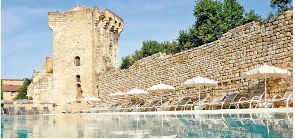
Aquabella Hotel & Spa | Aix-en-Provence