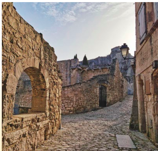
Medieval streets of Les Baux

Enrichment: Splendors of Aix-en-Provence & the South of France.