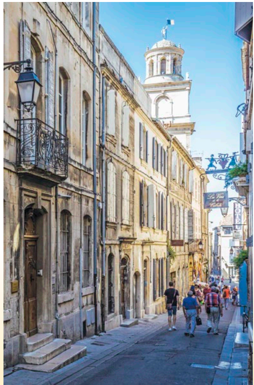
Walking tour of Arles