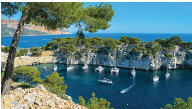
Above: Calanques of Marseille near Cassis | Below: Lourmarin