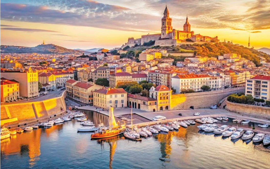
Notre-Dame de la Garde perched above the Port of Marseille