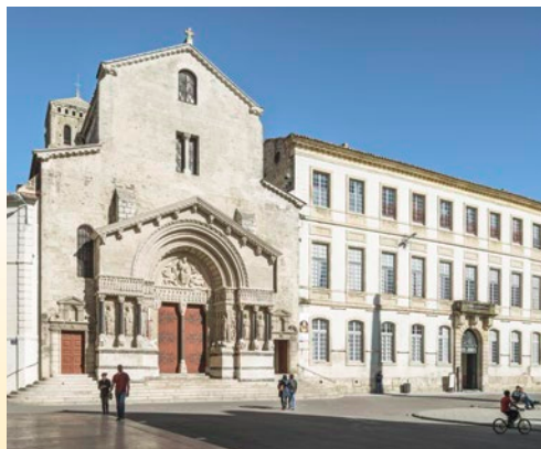
Cathédrale Saint-Trophime, Arles

Return to Aix for a festive group dinner tonight.