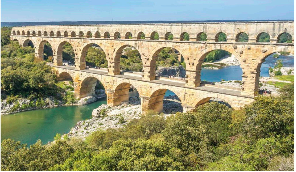
Pont du Gard