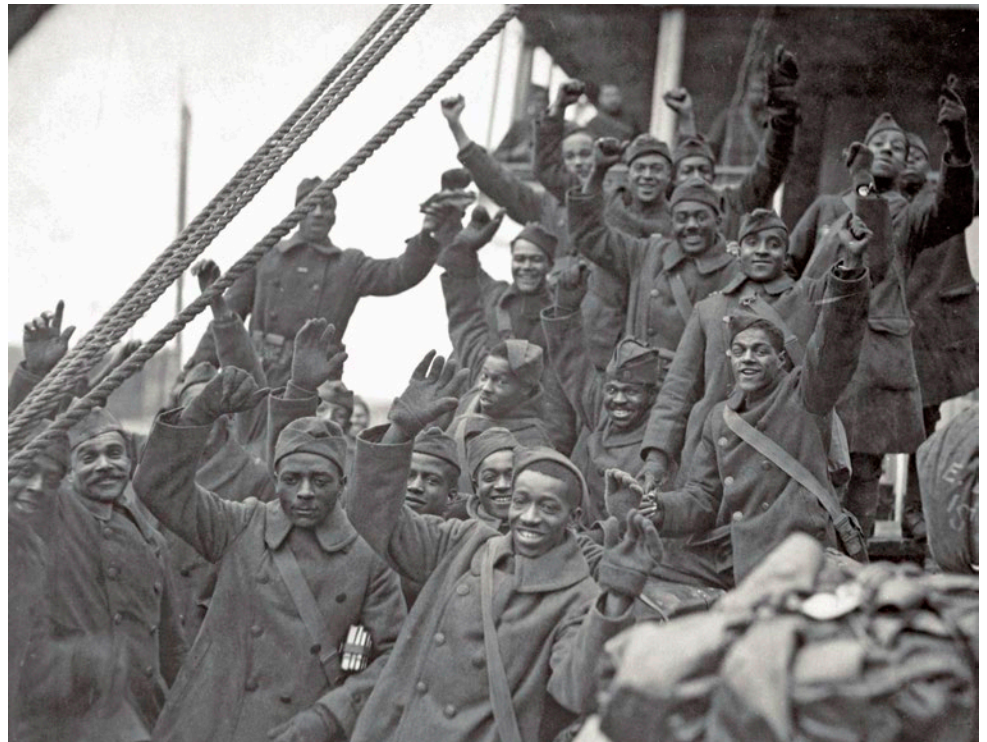
369th Infantry Regiment

An Evening of Jazz. Trace the evolution of French jazz as you stroll through the Latin Quarter and Saint-Germain-des-Prés, where African American musicians played post-WWII. Learn about musical legends, followed by dinner and a concert at a local jazz club.