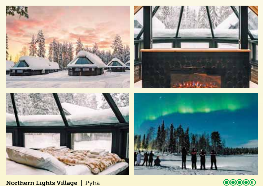
Northern Lights Village | Pyhä