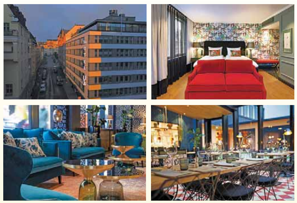
Hotel U14 | Helsinki